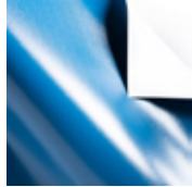
Royal Blue, Kidskin 1086