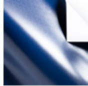
Ultramarine Blue, Kidskin 1046