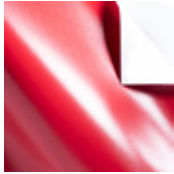
Colonial Red, Kidskin 1071