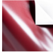
Florentine Red, Kidskin 1079