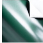
Everglade, Kidskin 1080