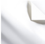
White, Kidskin 1085