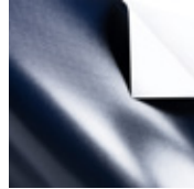
Navy, Kidskin 1093