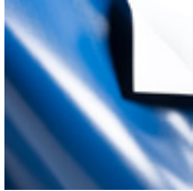
Coastal, Kidskin 1082